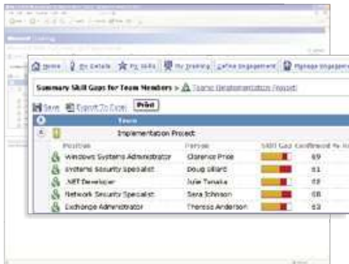
SKILL GAP ANALYSIS S

Verify alignment: This phase is your organization's opportunity to review, influence, and validate the skills matrixes created in the Definition phase. This ensures the thoroughness and integrity of the skills chosen to be assessed. Your organization's IT manager then ensures that each person is properly assigned to the correct position and job role.