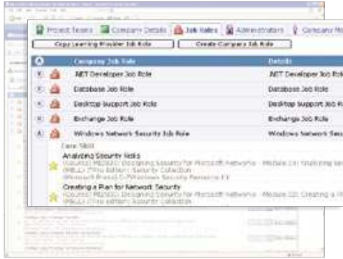
DEFINING COMPANY JOB ROLE S