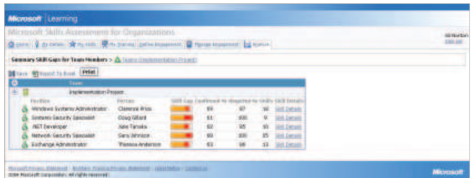
Skill Gap Analysis

Microsoft Skills Assessment for Organizations provides a clearer understanding of your employees' skills so you can plan better and spend better